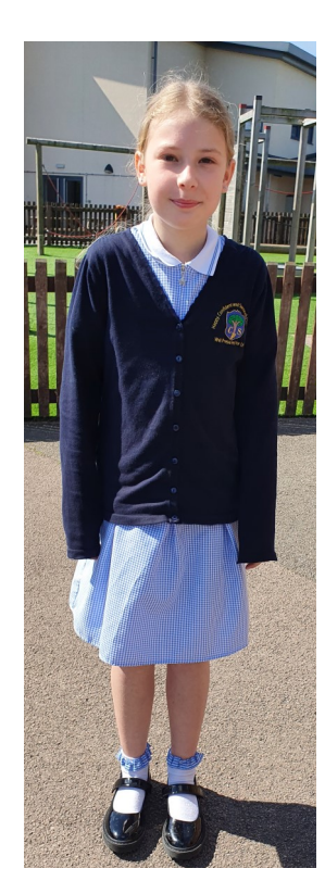
Key Stage 2 (Year 3, Year 4 Year 5 and Year 6) standard and summer uniform