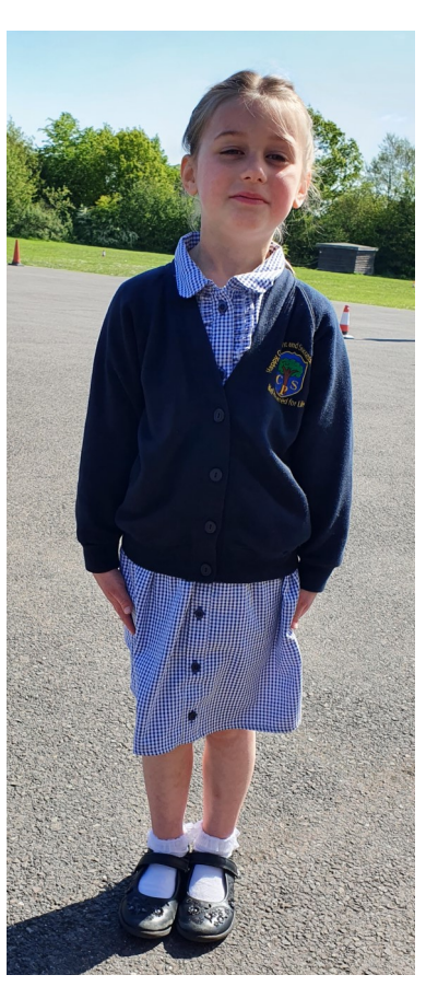
Reception and Key Stage 1 (Reception, Year 1 and Year 2) standard and summer uniform