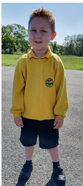
Nursery standard and summer uniform