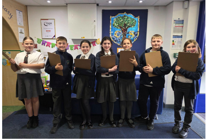
Pictured above from left to right are:

We were extremely proud of our Year 5 & Year 6 Parents' Evening guides for the fantastic way they represented our school when meeting and greeting Parents and Carers at the meetings held in the week before the Easter break. Once again, our children displayed excellent manners and great people skills, which is exactly what we want our pupils at The Coppice to do. I listened into many of the conversations being held and was so impressed with the high quality oracy skills (both speaking and listening) being used by these children. A huge well done to all of them and a big thank you goes to the Parents and Carers who gave us such lovely feedback about these children.